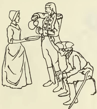
REVOLUTIONARY WAR 1775-1783